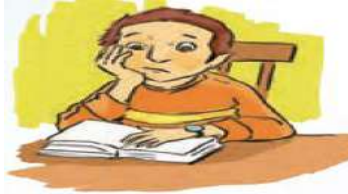
The book was boring.